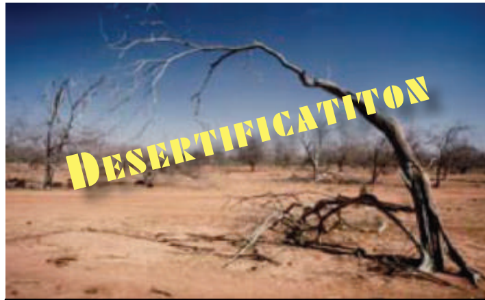
“Political Will to Stop Spreading Deserts is Missing.” < http://www.desertification.net > Photo: Dead Vegetation. < http://www.wateryear2003.org/en/ev.php-URL_ID=5148&URL_DO=DO_TOPIC&URL_SECTION=201.html >. See p 12 for a brief discussion of concept.

Then President George Bush, former oil man himself, pulled the U.S. out of the Kyoto Treaty, claiming that “the targets